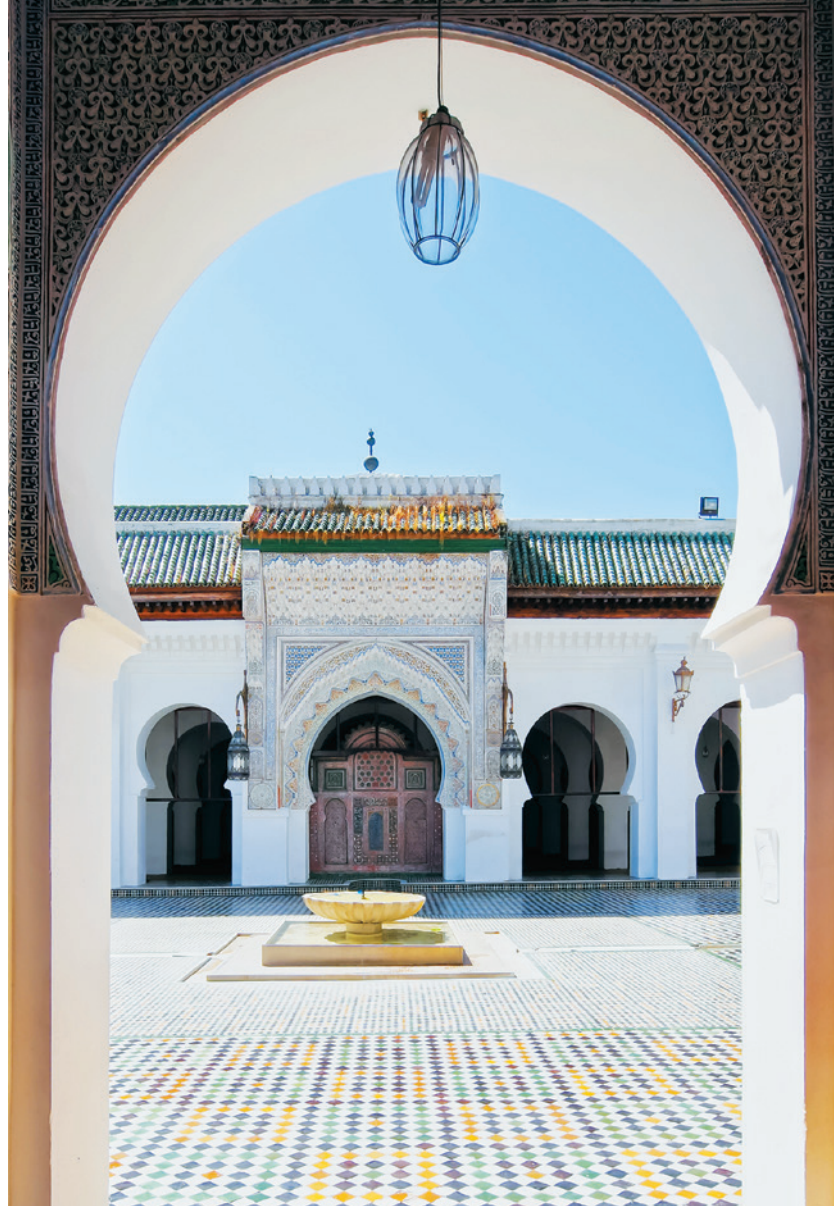
The world's oldest continually operational university was founded in Fes, Morocco, in AD 859.