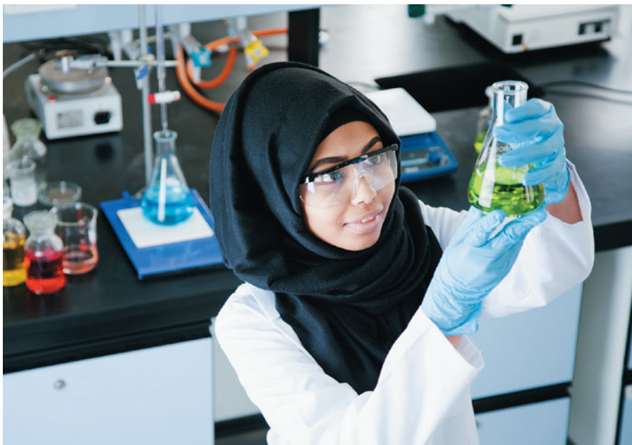
Science students at the American University of Sharjah must take humanities and social-science courses.

education and culture. To encourage the production of higher-quality, local textbooks and other academic material, universities need to reward staff for producing these at least as much as they do for research publication.